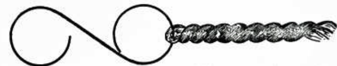
Fig. 2.—Stranded rubber motors should be connected to a strong S-shaped hook, as here, the open end of the hook then being coupled to the propeller shaft.